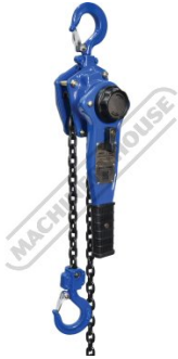
Main View Handle Down