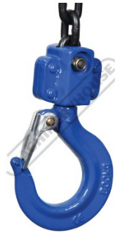
Bottom Hook Assembly