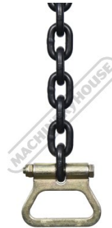
Length Chain End