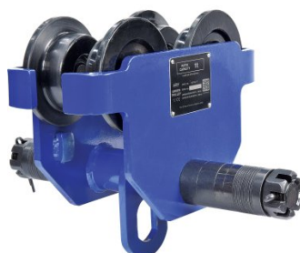
C147 Girder Trolley