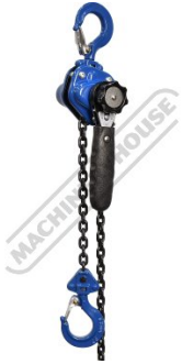
Main View Handle Down