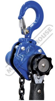
Lever Handle Mechanism