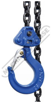
Bottom Hook Assembly