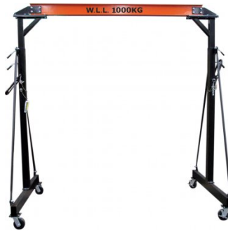
C188 Mobile Girder Rail Gantry