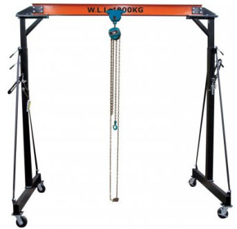
K088 Mobile Girder Rail Gantry Package Deal