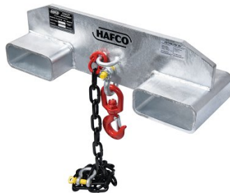
C195 Forklift Jib Attachment