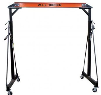
C188 Mobile Girder Rail Gantry