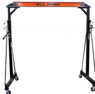
C188 Mobile Girder Rail Gantry