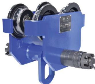
C148 Girder Trolley