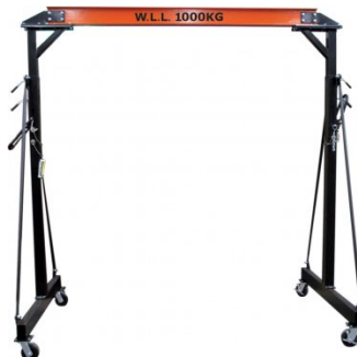
C188 Mobile Girder Rail Gantry