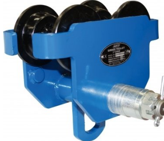
C148 Girder Trolley