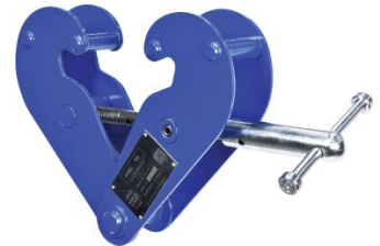
C146 Girder Clamp