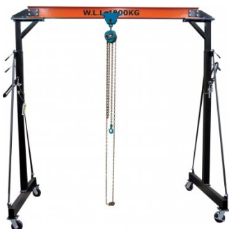
K088 Mobile Girder Rail Gantry Package Deal