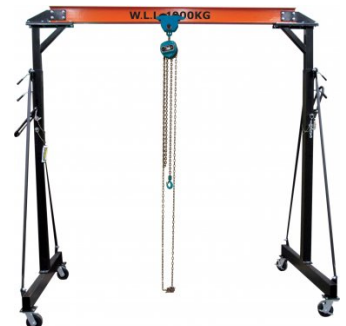
K088 Mobile Girder Rail Gantry Package Deal