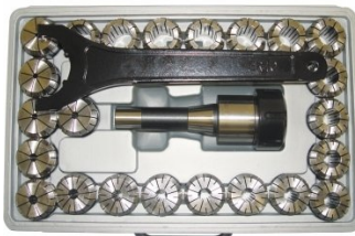
C964 Collet & Chuck Set - 25 Piece