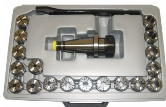
C929 Collet & Chuck Set - 20 Piece