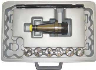
C925 Collet & Chuck Set - 8 Piece