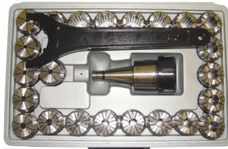
C965 Collet & Chuck Set - 25 Piece