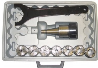
C961 Collet & Chuck Set - 9 Piece