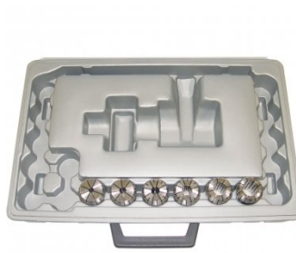
C921 ER32 Collet Set - 6 Piece