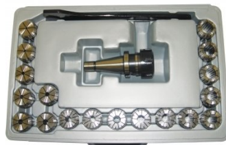
C928 Collet & Chuck Set - 20 Piece