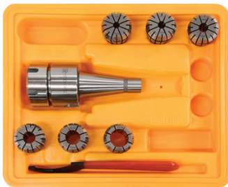
C9245 Collet & Chuck Set - 8 Piece