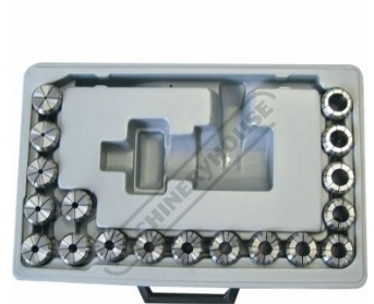
C922 ER32 Collet Set - 18 Piece