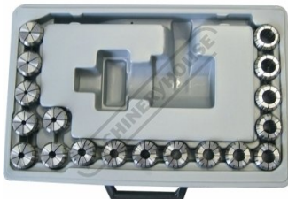
C923 Collet & Chuck Set - 8 Piece