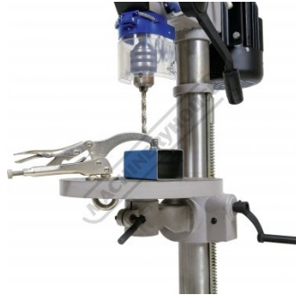
Shown Clamping Job on an Optional Drilling Machine Low View