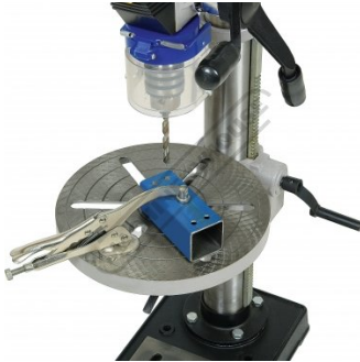
Shown Clamping Job on an Optional Drilling Machine Close Up