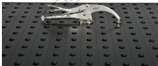
Shown on Welding Table Jaw Closed