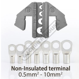
Non Insulated Terminal Jaw