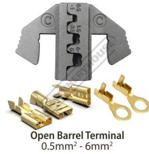
Open Barrel Terminal Jaw