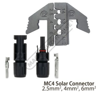
MC4 Solar Connector Jaw