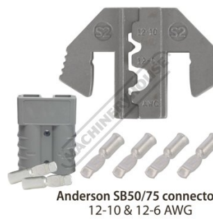
Anderson Plug Jaws