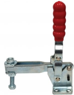
C0998 Vertical Toggle Clamp