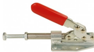
C1008 Straight Line Toggle Clamp