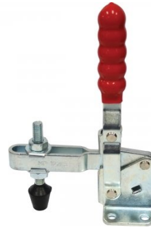
C0999 Vertical Toggle Clamp