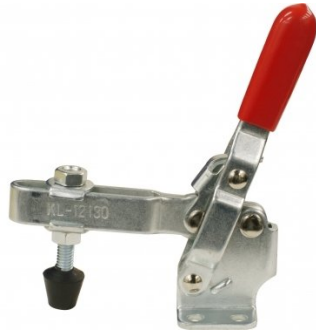
C100 Vertical Toggle Clamp