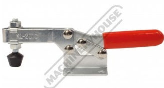
C1006 Horizontal Toggle Clamp