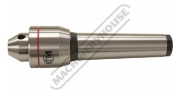
Live Centre Side View