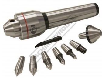
Set Shown With Tips