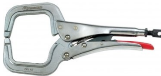
W1016 Locking C-Clamp - Round Tip