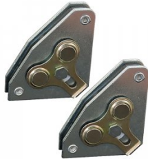
W1011 XYZ Magnet Squares - Multi-Angle - (2-Pack)