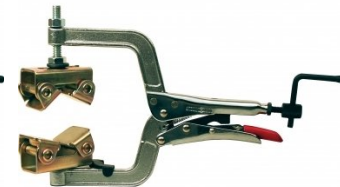
W1015 Pipe Plier