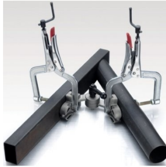
W1013 Corner Clamping Plier Set