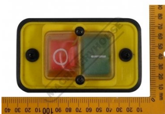
BL023 SWITCH no23