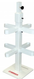
S2238 Steel Dolly Stand