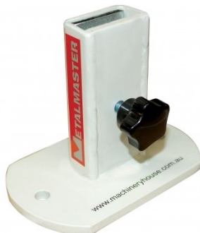
S2239 Dolly Stand Holder