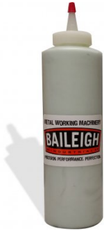
B8119 Pipe/Tube Bending Lube - 475ml