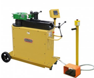
B8090 Motorised Pipe & Tube Rotary Draw Bender