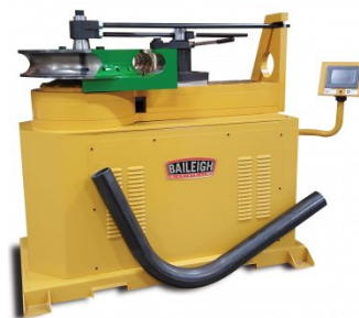
B8100 Motorised Pipe & Tube Rotary Draw Bender