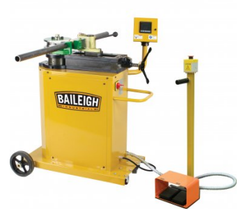
B8085 Motorised Pipe & Tube Rotary Draw Bender