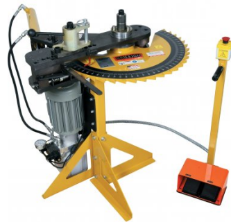
B8075 Hydraulic Pipe & Tube Rotary Draw Bender