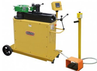
B8090 Motorised Pipe & Tube Rotary Draw Bender