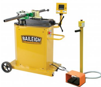
B8085 Motorised Pipe & Tube Rotary Draw Bender