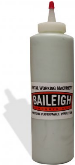
B8119 Pipe/Tube Bending Lube - 475ml