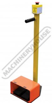
Foot Control Emergency Stop