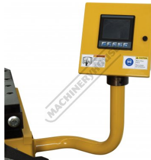
Easy to Use Touchscreen