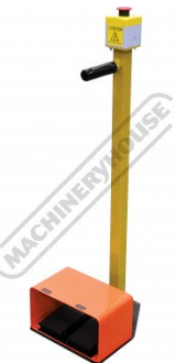
Foot Control Emergency Stop