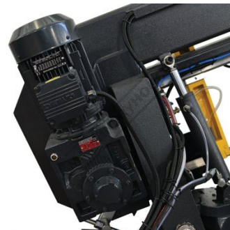
Motor Gearbox Drive