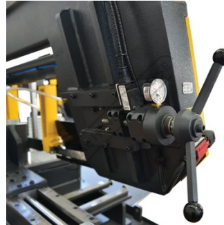
Manual Hydraulic Blade Tension