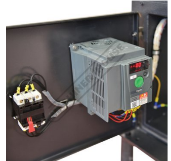
Schneider Inverter Control