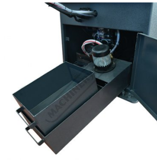
Removable Coolant Tray