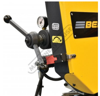
Blade Guard Safety Switches