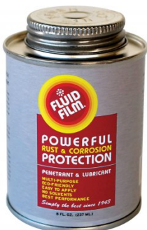
O043 Rust & Corrosion Preventive - Penetrant & Lubricant