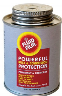
O043 Rust & Corrosion Preventive - Penetrant & Lubricant