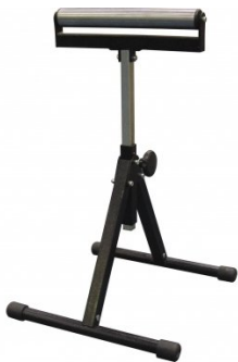
W343A Roller Stand