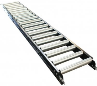
L818 Roller Conveyor