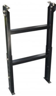
L822 Roller Conveyor Stand