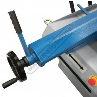
Quick Action Clamp Lever