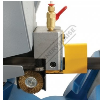
Wire Wheel and Roller Bearing Blade Guides