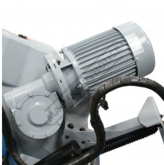
Motor and Gearbox Drive