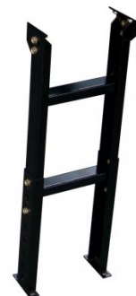
L814 Roller Conveyor Stand