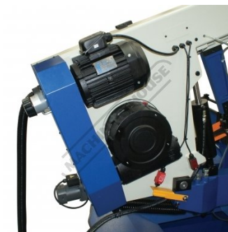
Gearbox and Motor