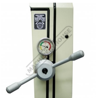
Blade Tension Dial with Gauge