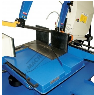
Vice Dual Mitre