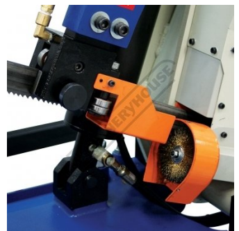
Blade Guides and Blade Cleaning Brush