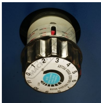
Variable Blade Speed