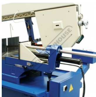
Vice Rear View