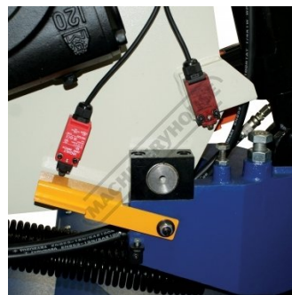
Micro Switches Control on Head