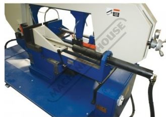
Full Stroke Hydraulic Clamping Vice