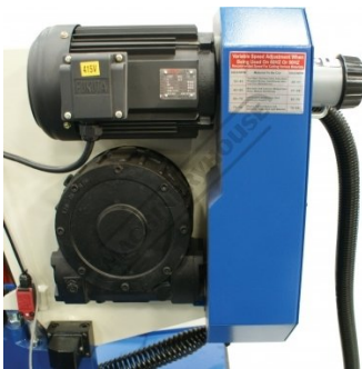
Heavy Duty Gearbox