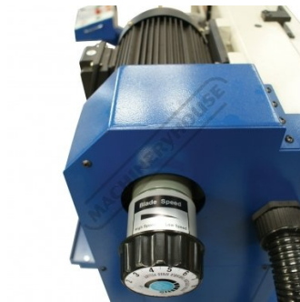
Variable Blade Speed