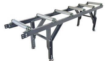
L835 Roller Conveyor with Adjustable Stands - Extra Heavy Duty