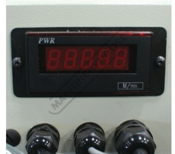
Digital Blade Speed Display