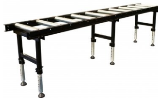
L830 Roller Conveyor with Adjustable Stands - Heavy Duty