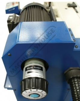
Variable Blade Speed