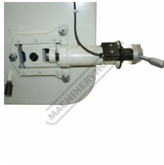
Blade Breakage Rear