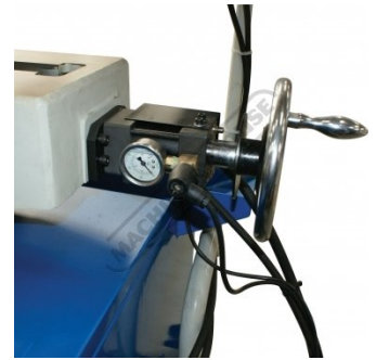
Hydraulic Vice Rear