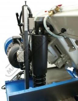
Rear Hydraulic System