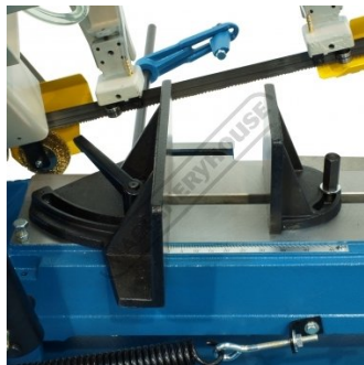
Vice At 0 Degrees