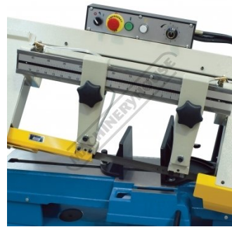
Quick Adjustment Blade Guide System