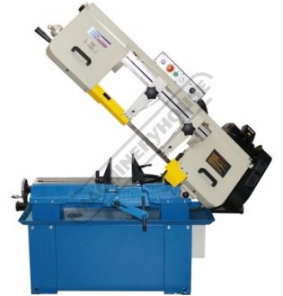
Front View Head Fully Up