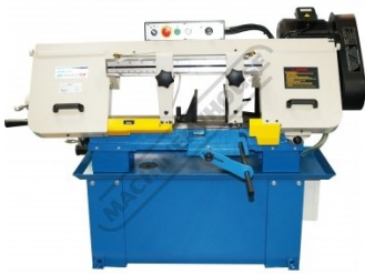
Front View Head Fully Down