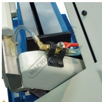
Coolant Shut Off Valve