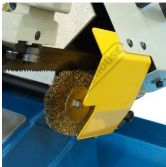
Blade Cleaning Brush