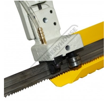
Carbide Blade Guides With Bearings