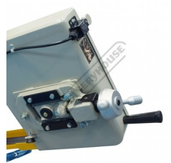
Blade Tension Mechanism