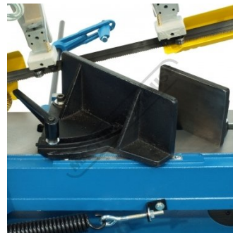
Vice At 45 Degrees