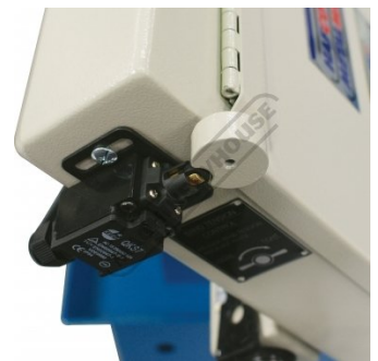
Blade Guard Safety Micro Switch on Left Side