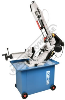
Head Fully Raised