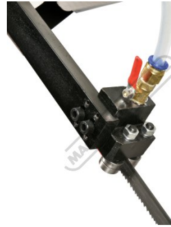
Coolant to Blade