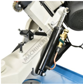
Hydraulic Ram Down Feed Control