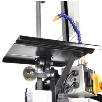
Vertical Cutting Table Fitted