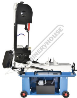
Rear View Fully Raised