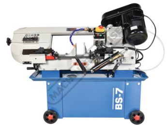
Front View Arm Fully Down