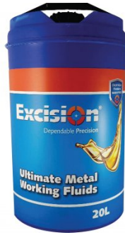
S091 Soluble Metal Cutting Fluid - 20 Litre