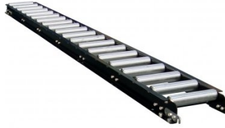
L812 Roller Conveyor