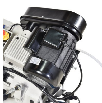
Heavy Duty 1HP 240V Motor