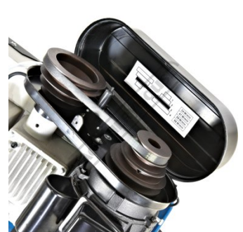
4 Speed Belt Drive System with Safety Micro Switch