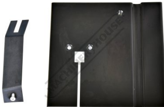
Vertical Cutting Table Parts