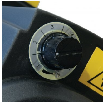
Variable Speed Dial