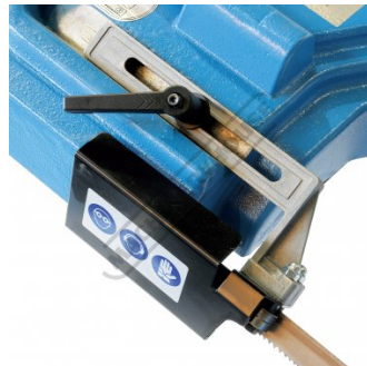
Blade Guide Adjustment