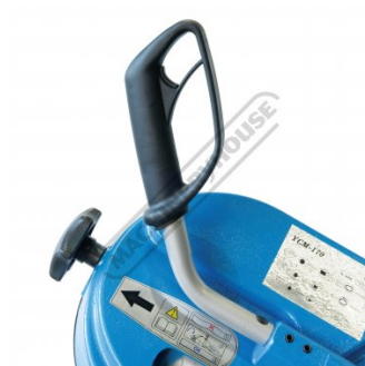
Blade Trigger on/off Switch