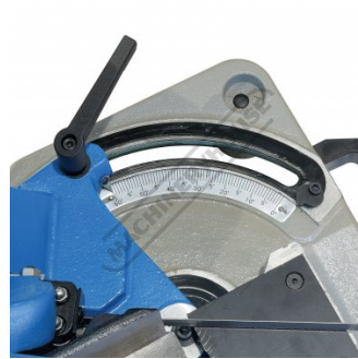
Swivel Head Angle Scale