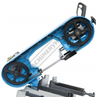
Rear View Blade Guard Off