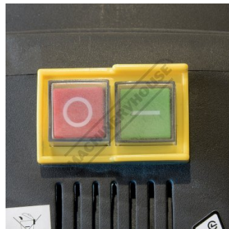
Main Power Switch