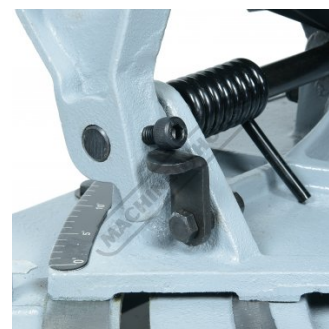
Vertical Head Position Safety Latch