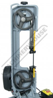
Blade Drive System