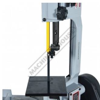
Vertical Cutting Table Close Up