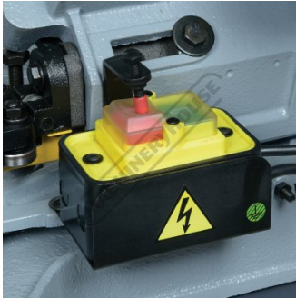
Automatic Electric Cut Out Switch