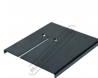
Includes Vertical Cutting Table