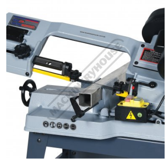
Shown Cutting Steel Tube