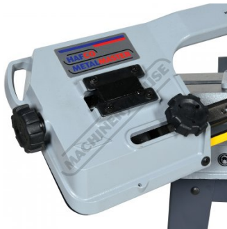
Blade Tension Dial