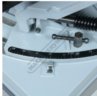
Swivel Head Scale Set at 30 Degrees