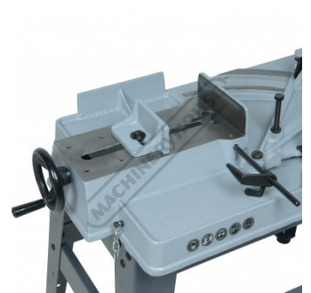
Vice Clamping Fixture