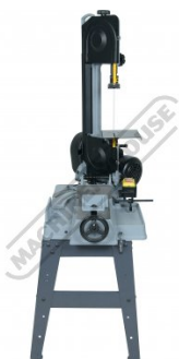
Vertical Cutting Table Front View