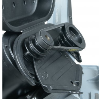
3 Speed Pulley Drive System