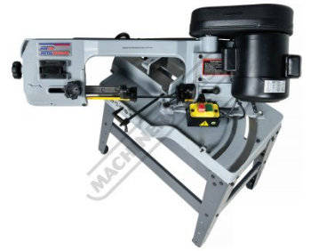
Top View at 45 Degrees