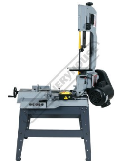
Shown with Vertical Cutting Table