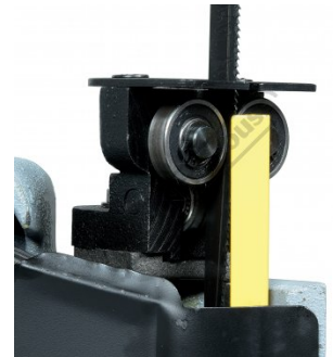
Rear Ball Bearing Blade Guides