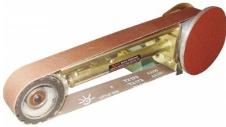
L088 Multitool Belt & Disc Linishing Attachment