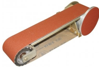
L089 Multitool Belt & Disc Linishing Attachment