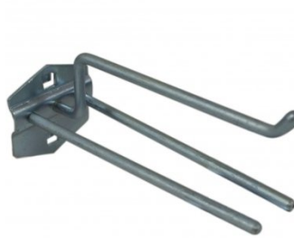
A444 Plier Holder - Triple Prong