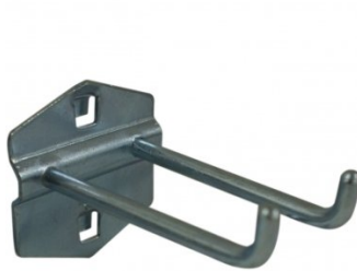
A442 Hook - Double Prong