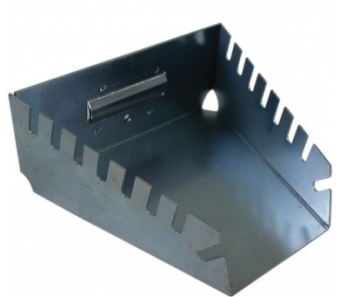
A446 Holder - Spanner