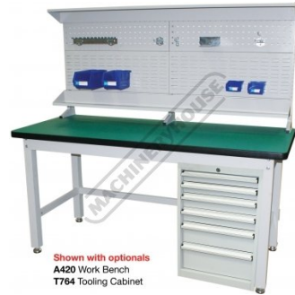
Shown with all Optionals

Shown with optionals A420 Work Bench T764 Tooling Cabinet