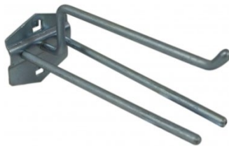
A444 Plier Holder - Triple Prong