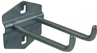
A442 Hook - Double Prong