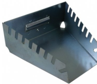
A446 Holder - Spanner