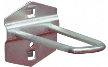
A449 Hook - U Shape Holder