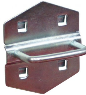
A4492 Hook - U Shape Holder