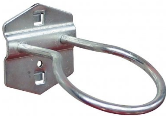
A4496 Round Tool Holder - Loop