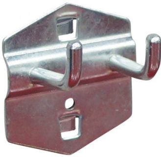
A441 Hook - Double Prong