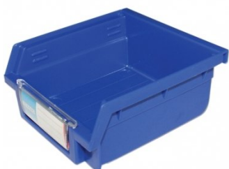
A430 Plastic Bucket