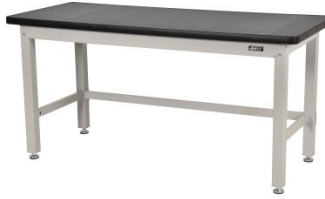
A420 Industrial Work Bench