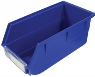
A436 Plastic Bucket