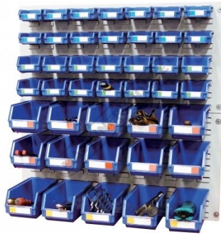
Shown with Optional Buckets and Tools