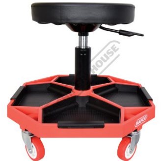
Lowest Seat Height is 410mm