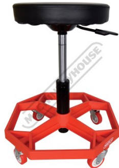
Seat Without Trays