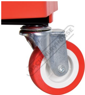
Swivel Caster Wheel