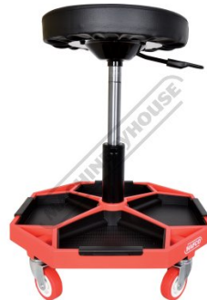
Max Seat Height is 550mm