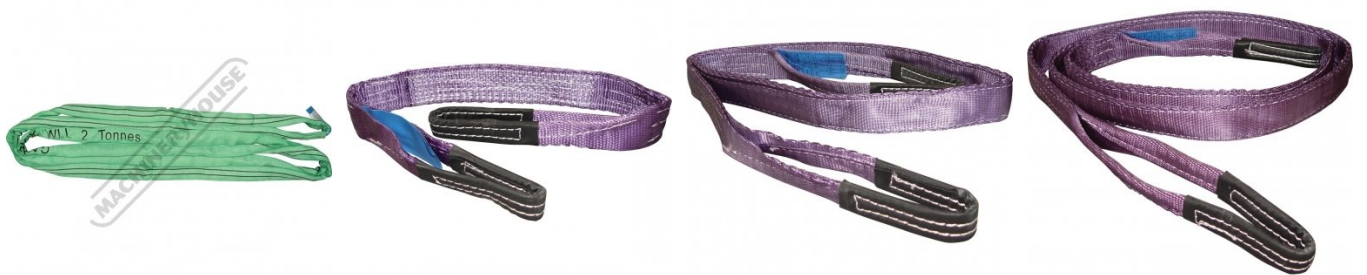
H320 Flat Slings