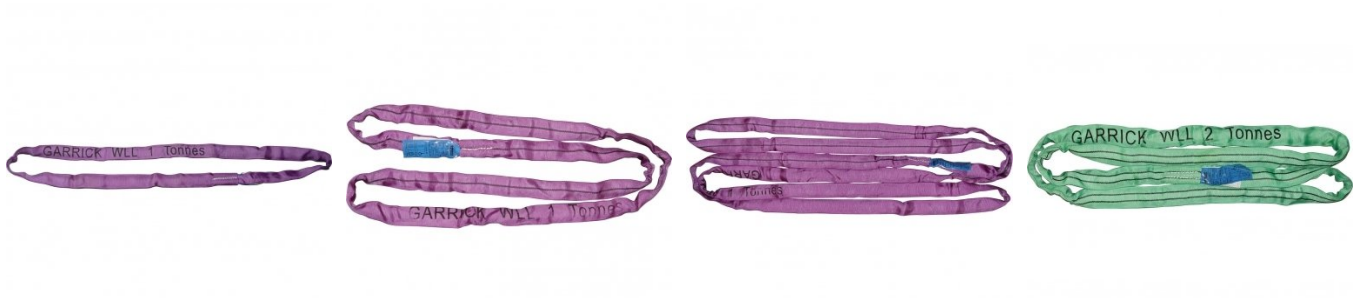
H312 Round Slings