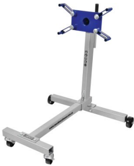
A341 Engine Stand - 450kg Capacity