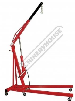
Shown Fully Up and Extended