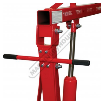
Handle For Easy Manoeuvrability