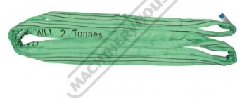
H312 Round Sling