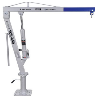
A353 Swivel Crane - Truck or Ute