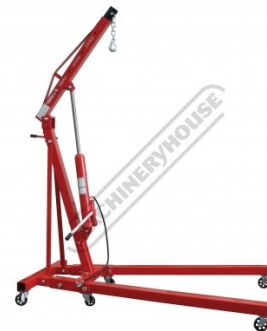
Shown Fully Up