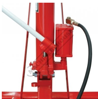
Pneumatic Hydraulic Pump