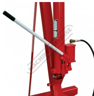
Single Action Manual Pump