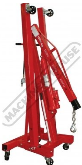
Shown Folded Up