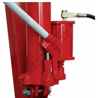
Single Action Pump With Release Valve