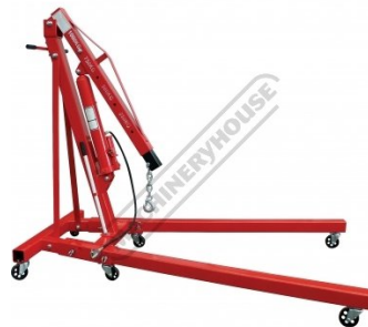
Shown With Ram Fully Down