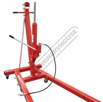
Pneumatic Hydraulic Single Action Ram