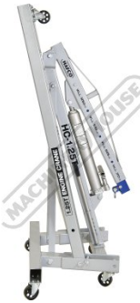
Fold Up Legs for Easy Storage