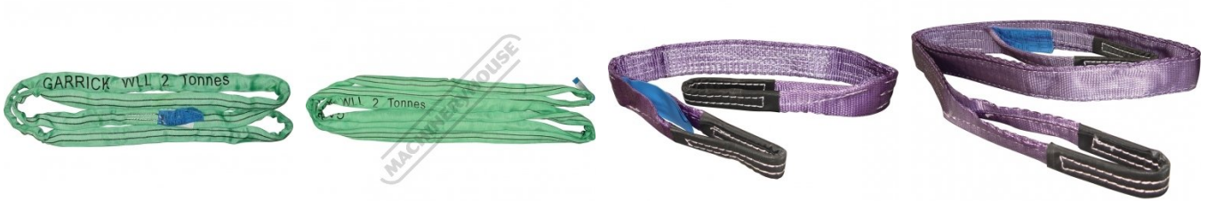
H320 Flat Sling