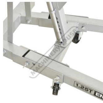
Quick Release Lock Pins to Legs