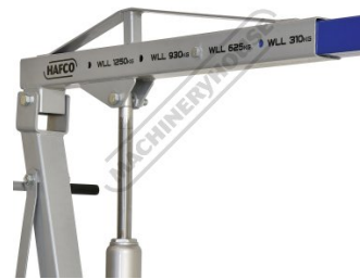
Slide Out Jib with 4 WLL Lifting Positions