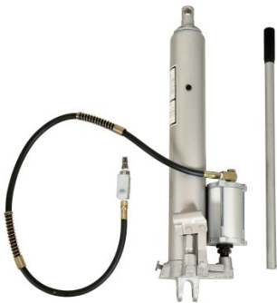
J033 Pneumatic / Hydraulic Ram - Long Stroke with Yoke