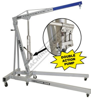
Double Action Pump