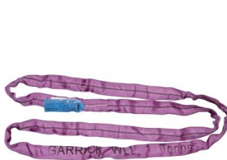
H305 Round Sling