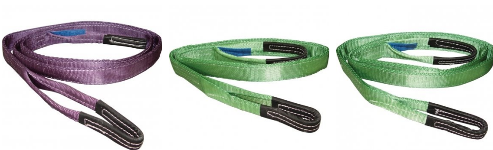
H324 Flat Sling