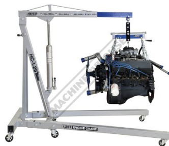
Shown Lifting V8 Engine with Optional Engine Tilter