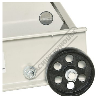
Rear Caster Wheels