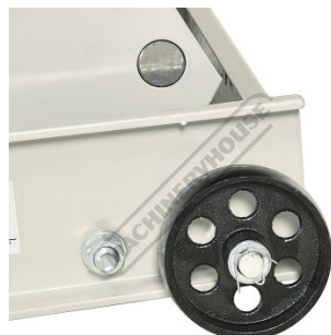
Rear Caster Wheels