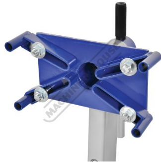
Adjustable Head Arms