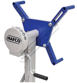
Handle For Geared Rotating Head