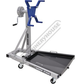
Shown with Optional ESMT 16 Drip Tray A338