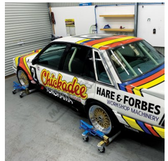
Vehicle on Jacks Ready to Move