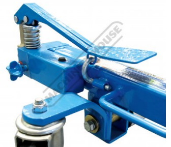
Foot Pedal Secured In Down Position