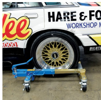
Jack in Place Ready To Lift Vehicle