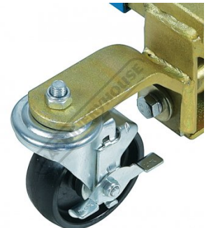
2 x Swivel Wheels with Brake