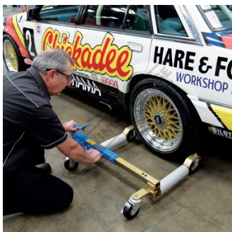
Sliding Jack in Positioning