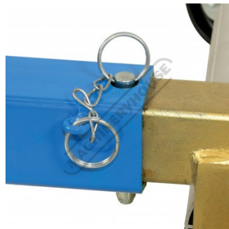
Safety Lock Pin For Ram