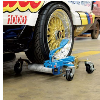
Wheels Jacked Ready to Move Vehicle