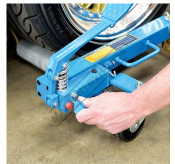
Closing Valve Ready To Lift Vehicle