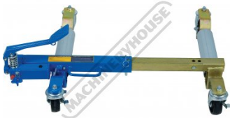
Front View Extended