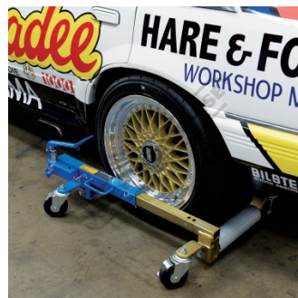
Jack in Place Ready To Lift Vehicle