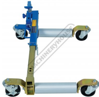
Side View Extended