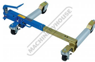
Right Side Extended