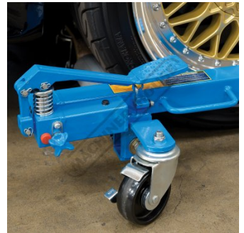
Foot Pedal Secured In Down Position