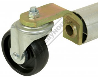
2 x Swivel Wheels