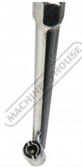
Dual Ended Chuck 2