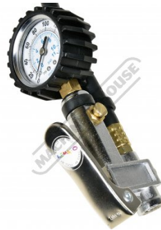
Air Lever and Release Button