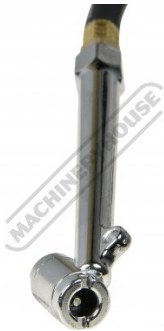
Dual Ended Chuck