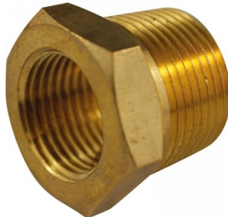
F842 Air Fittings