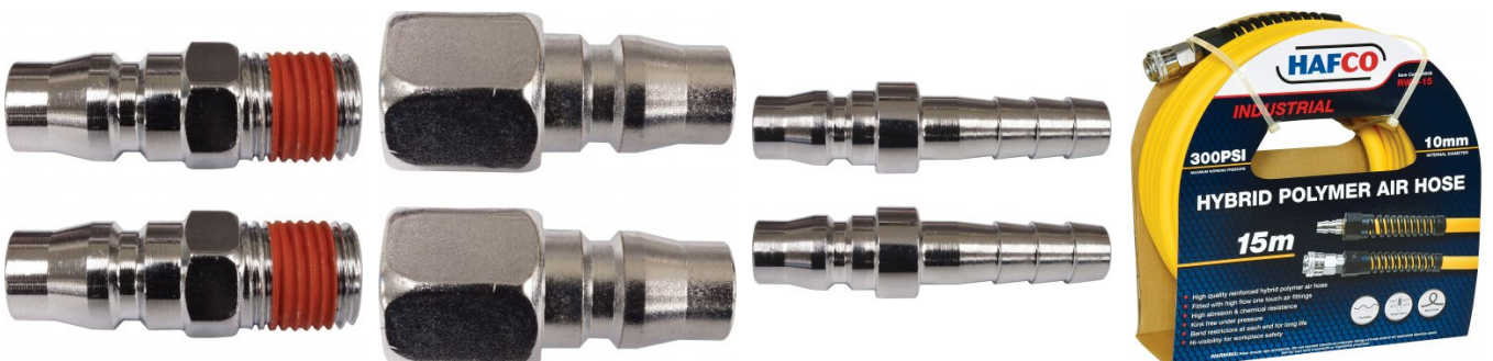
H008 Industrial Polymer Air Hose