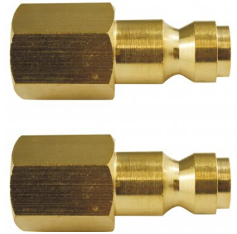
F903B Air Fittings