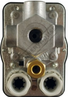
Bottom Of Pressure Switch